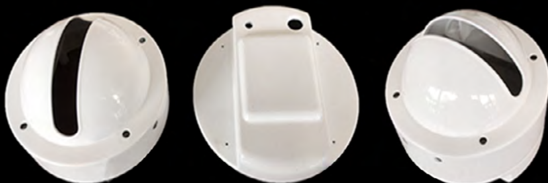
Figure 3 - Farsoon series production of UAV camera module housing assembly.