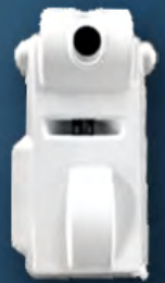
Figure 1: Hawk Eye Technology 6- rotor UAV platform. Farsoon 3D printed accessory mounts for medial supplies delivery: extension arms, hooks, payload containers.