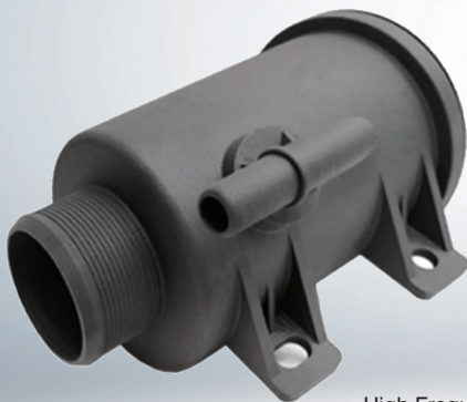
High Frequency Muffler System: FLIGHT® HT403P

Disclaimer: Many factors may affect the performance characteristics of products. We recommend that you make tests to determine the suitability of a product for your particular purpose prior to use. Farsoon makes no warranties of any type, express or implied, including but not limited to, the warranties of merchantability or fitness for a particular use. This also applies regarding the consideration of possible intellectual property rights as well as laws and regulations. Farsoon reserves the right to change the technical data without notice. Farsoon®, Buildstar®, Makestar® are registered trademarks of Farsoon Technologies. Last Change: 2022-01-29